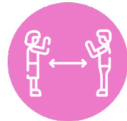
Physical Distancing Policies in Place