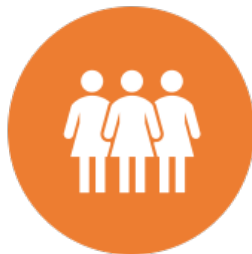
Quality Small Group Instruction