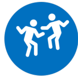
Fun and Energetic Dance Classes