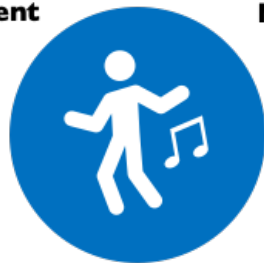
Socialization through games