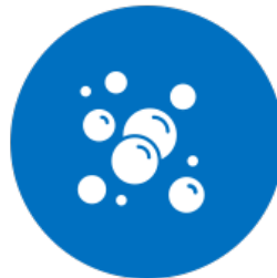
Increased Cleaning & Sanitizing Procedures