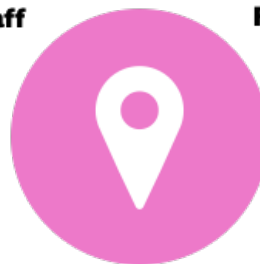
Outdoor Area Available